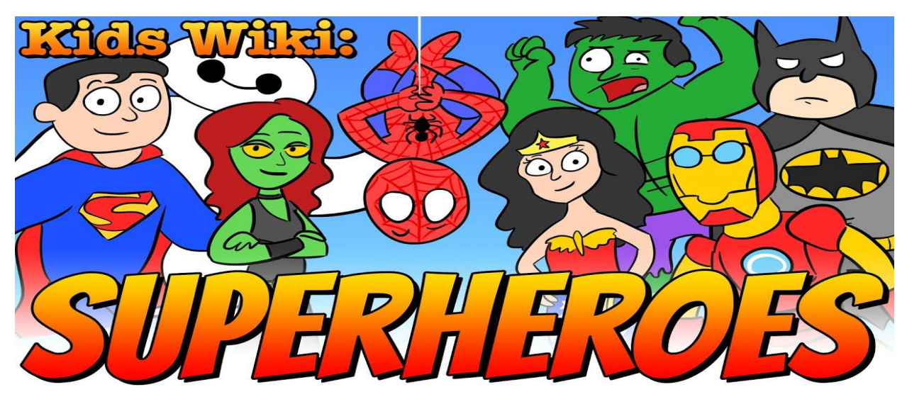
"What is a superhero? They're supposed to represent hope, opportunity and strength for everybody." – Aldis Hodge

Compile and put your holiday activities in an attractive folder.