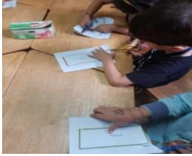
Use of scissors