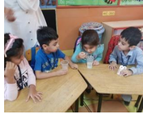
Taste and Tell