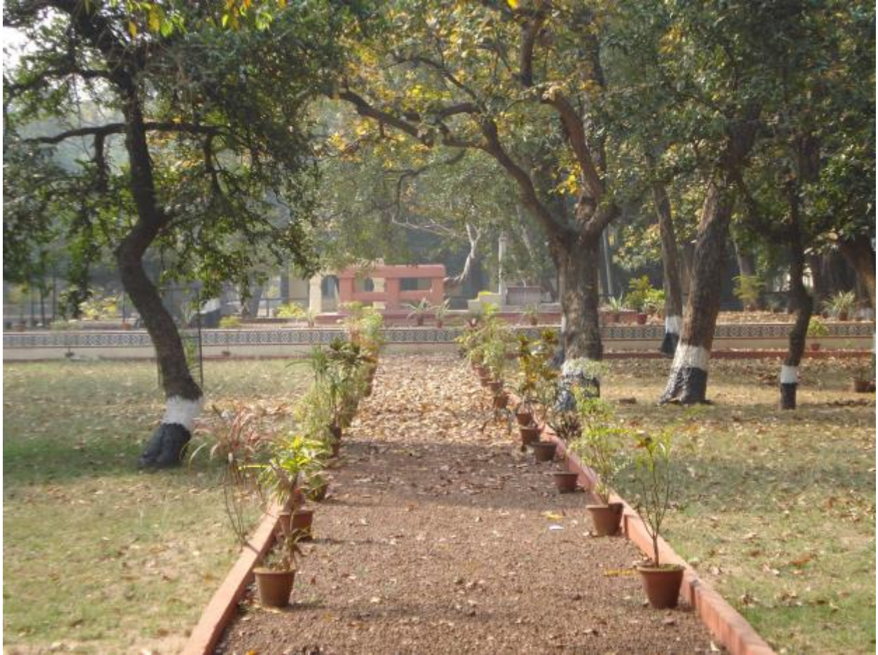
Shanti Niketan - an abode of peace