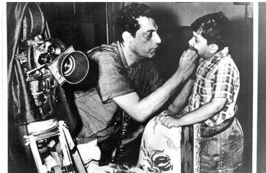
14 - Satyajit Ray