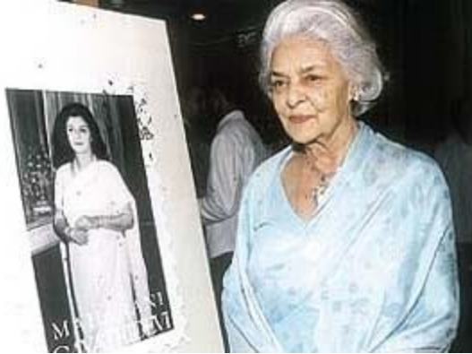
15 - Gayatri Devi