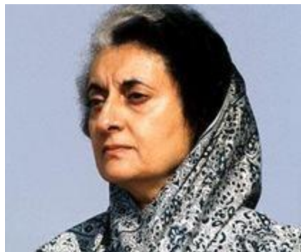
17 - Indira Gandhi