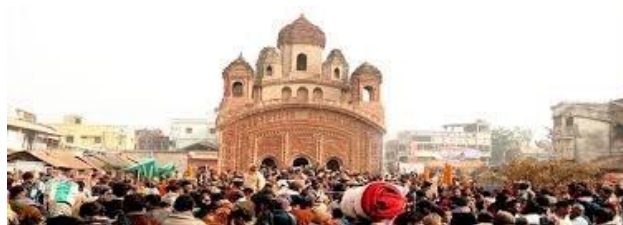
12 - Joydev Fair : This is famous for the baul music and folk music of Bengal. It starts from the Paush Sankranti or Makar Sankranti and lasts till the 2nd of Magh