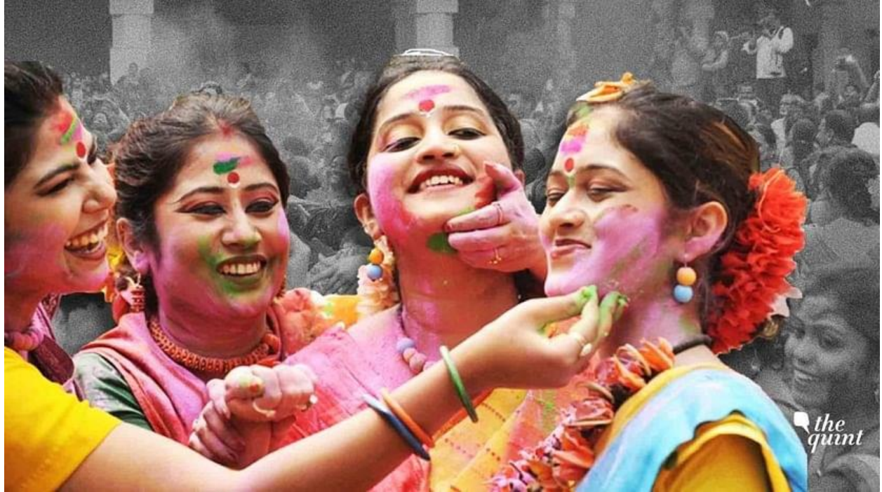
13 - Vasanta Utsav: Also known as dol utsav in Bengal, Vasanta utsav is the festival of colors. This festival is celebrated to welcome spring the season of color and romance. The students of the university dance and sing on the roads of Santiniketan, all dressed in yellow and they only have the colors as their makeup on this day.