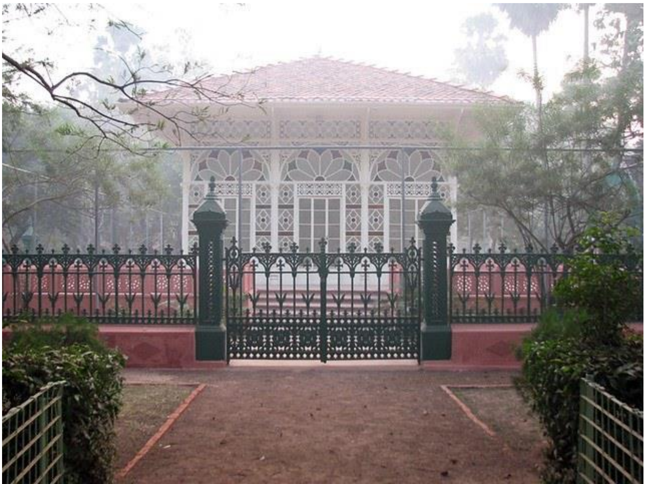
3 - Entrance Gate

Important and Historical place in Shanti Niketan.