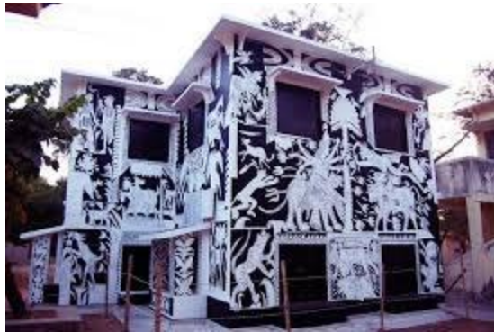
19 - Mural by KG Subramanyam