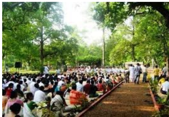
11 - Maghotsav : Foundation day of the Brambo samaj by Raja Rammohan Roy on January 23rd, 1830. According to the Bengali calendar it is 11th Magh. But this is a day celebrated with khichuri , mixed vegetables and chutney.