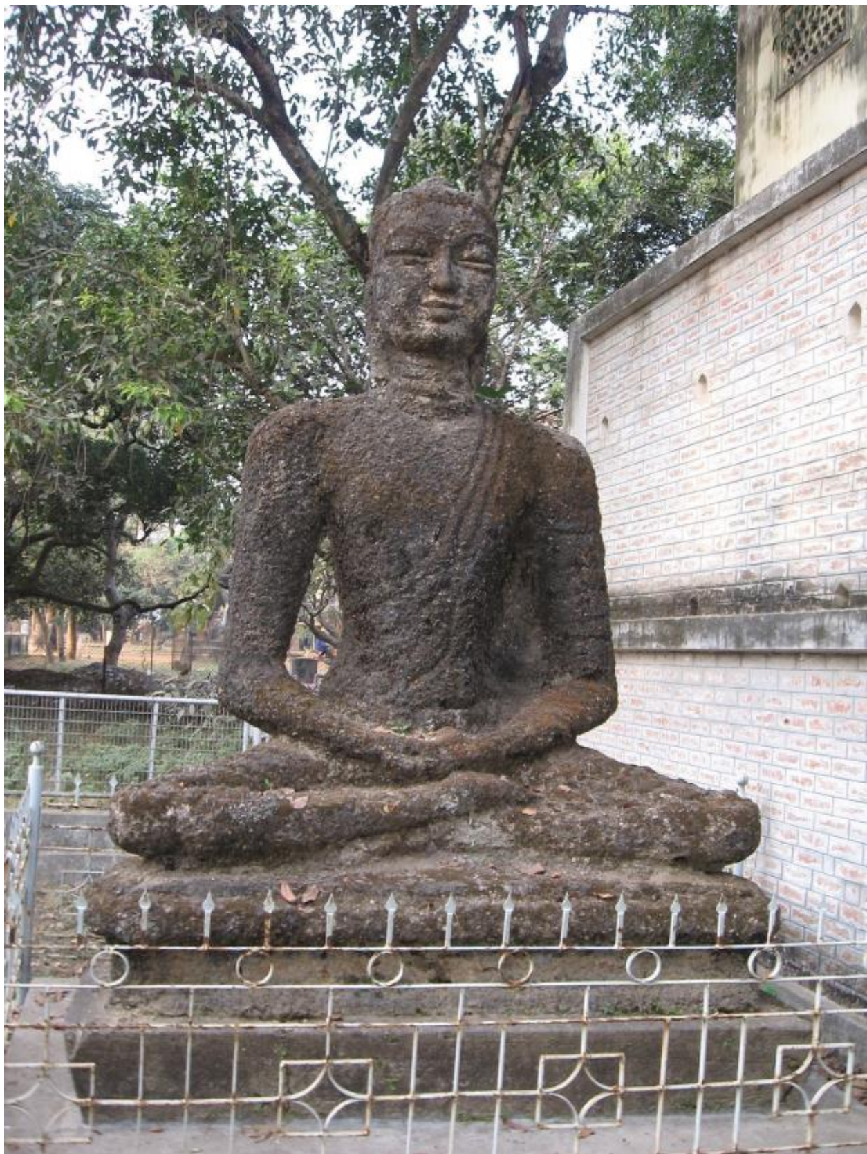
4 - Santal Family - Kinkar Baij