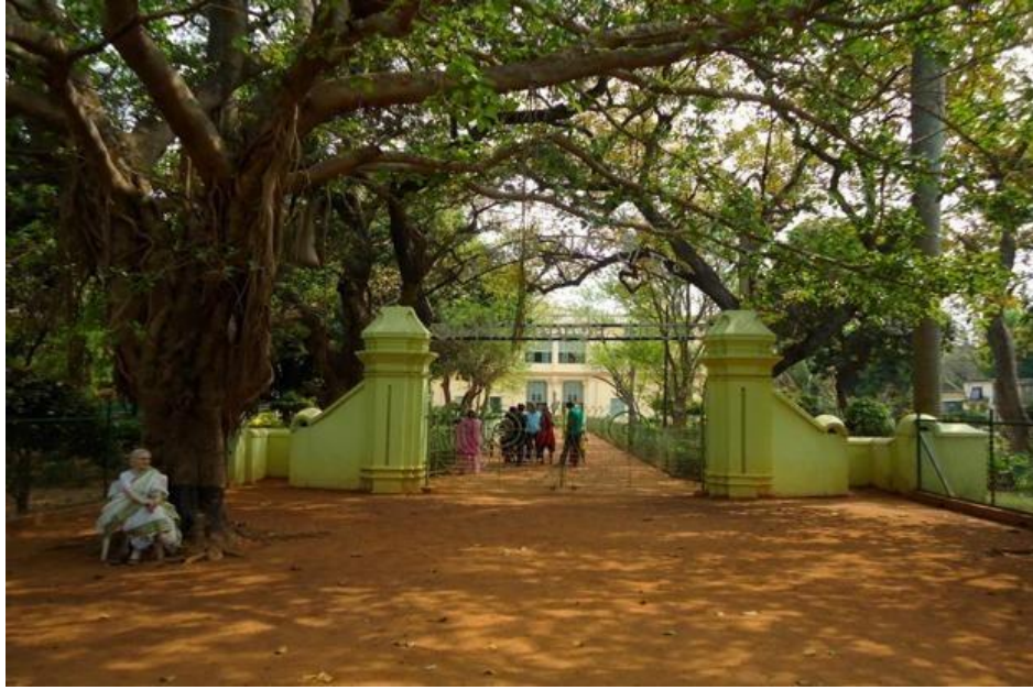
5 - Shanti Niketana Griha