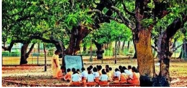
6 - Festivals in Shanti Niketan - Shantiketan celebrates various festivals and fairs all throughout the year