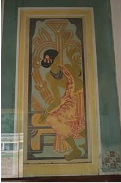
18 - Mural by Nandalal Bose