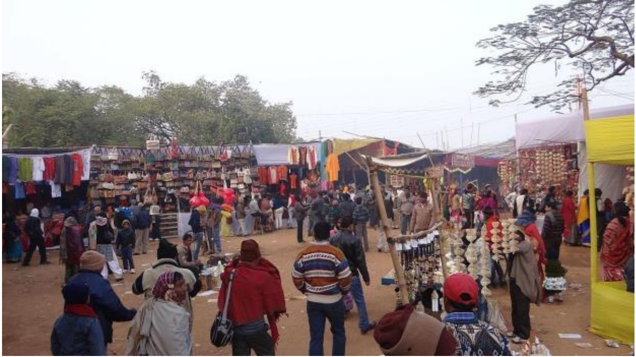
10 - Paush Utsav/Paush Mela (Fair) : lasts for three days in the month of December. Thousands of people across the country and outside flock down here to enjoy the best baul music here after the mesmerizing Joydev-Kenduli baul carnival. Rabindranath encouraged the popularity of baul music. Therefore, for all these three days music lovers from the corners of the country and the world come here to enjoy the rustic essence of Indian folk music. Besides women appreciate to collect the famous Shantiniketan sarees, kurtas, bags and their very own dokra (metallic) ornaments and miniatures for home décor from the fair held at the Bhuvandangar Math (ground)