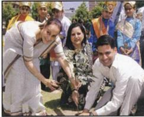
Sowing seeds for a greener tomorrow.

7 - Briksharopan: On 22nd and 23rd Shrawana i.e. August this festival is celebrated by planting saplings. They also observe the day as Halakarshan that means plowing as rainy season is the ideal time of plantations and agriculture in the arid land of Bolpur.