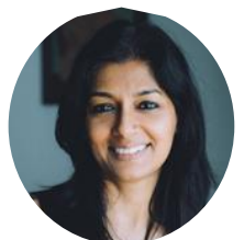
Nandita Das Actor and Filmmaker