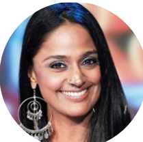
Suneeta Rao IndiPop Singer, Dancer, Actress